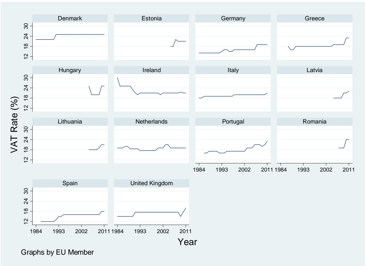
Figure 1 EU countries with VAT rate changes between 3 and 10 percentage points during sample period