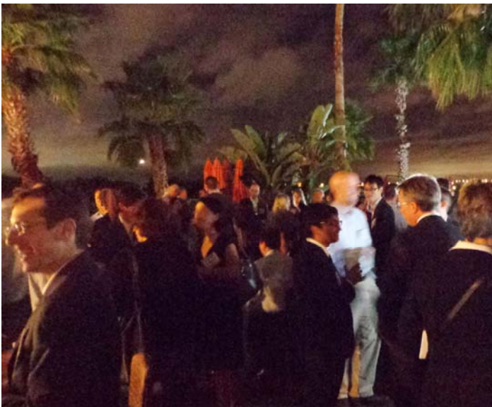
Reception at 2013 Conference in Tampa