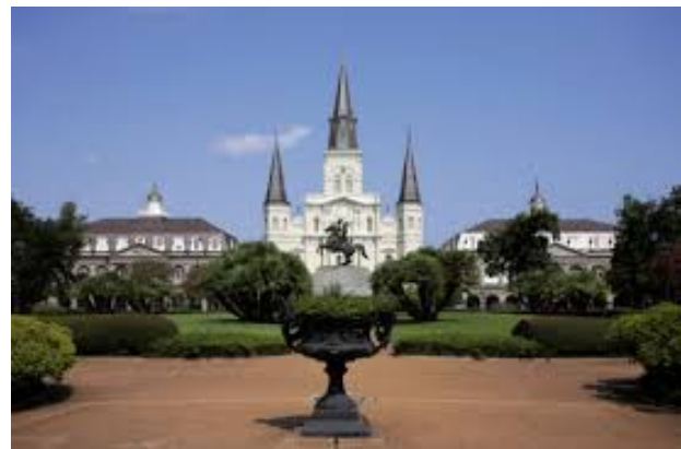
St. Louis Cathedral in New Orleans French Quarter