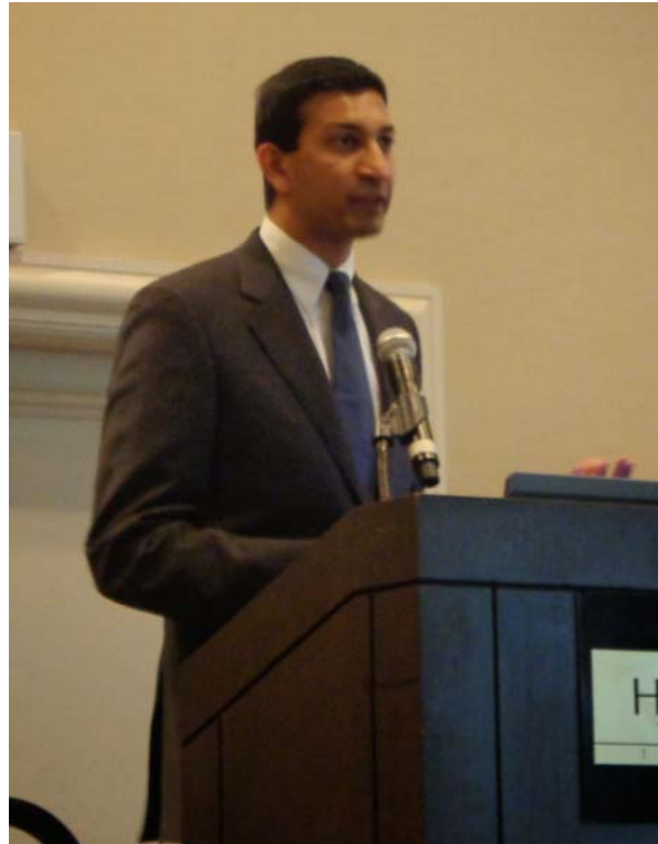
Raj Chetty speaking at luncheon