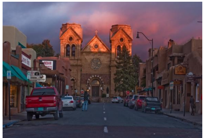
St. Francis Basilica in Downtown Santa Fe