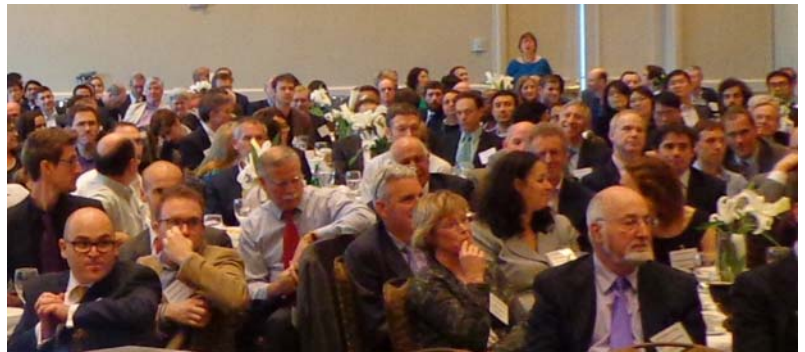
Luncheon listeners in Tampa