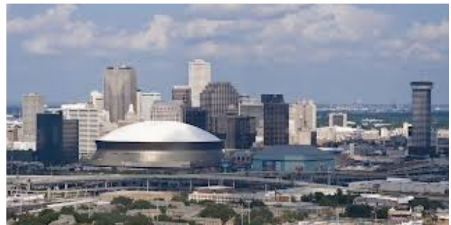
New Orleans downtown